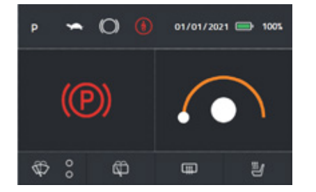
Standard information screen

An intuitive and easy menu allows drivers to adjust the operation of the truck to their needs.