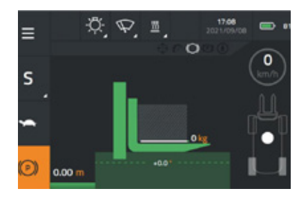
Optional colour touchscreen